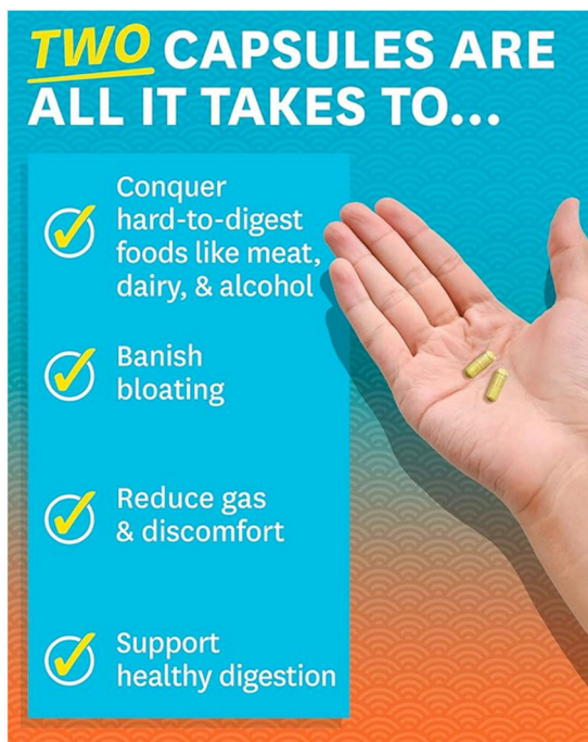
7 8 9 10 11 12 13 14 15 16 17 18 Figure 4

1 26. Defendant makes similar false and misleading claims on the marketing 2 and advertising on its Amazon store page for its No Bloat Product. For example, 3 aside from the name of the product “No Bloat” which, in it of itself, is an express 4 claim that the products eliminates bloating if taken as directed, Defendant claims that 5 the Product will “Banish Bloating,” includes a “Clinically Proven Probiotic,” and 6 “works within hours.” See Figures 4-5.