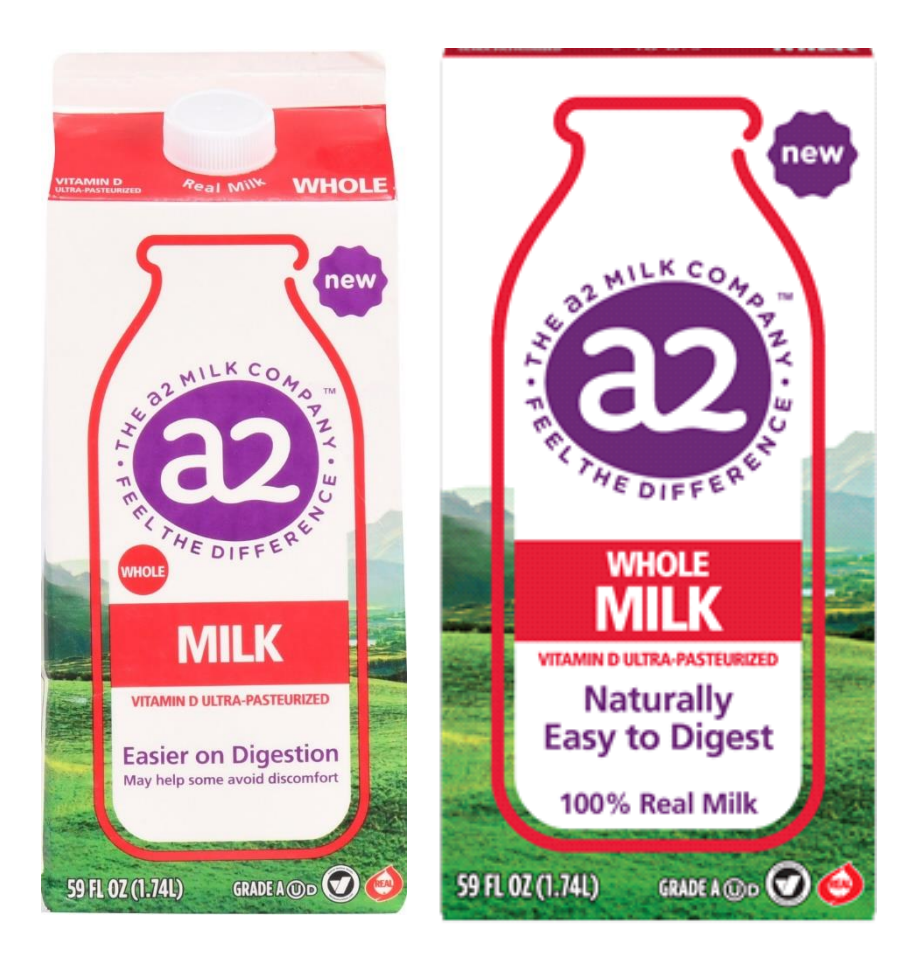
4. The other three sides elaborate on the front-label claims, describing "The a2 Milk Difference" by posing the rhetorical question below: