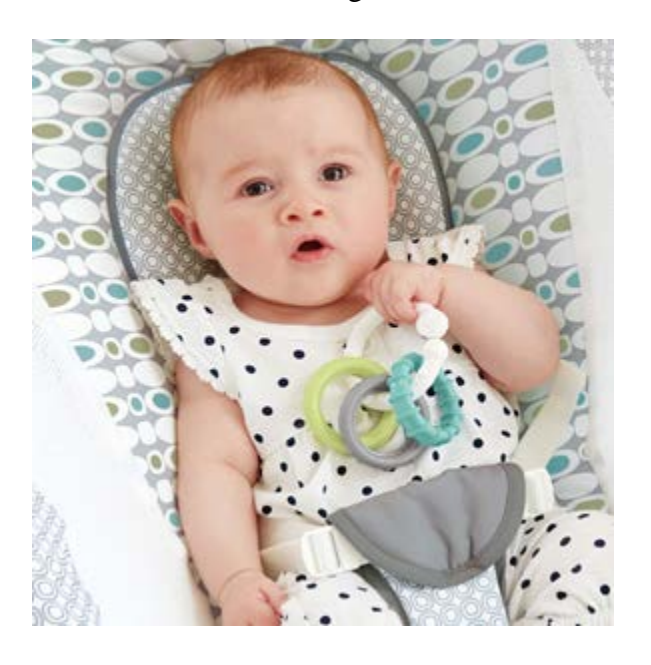
Above: Figure 3