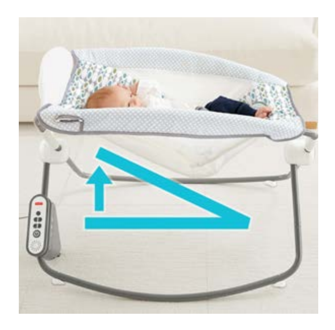
Above: Figure 2