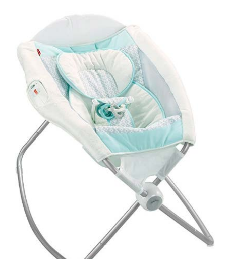
Above: Figure 5

33. Some "Premium" and "Deluxe" models, such as the deluxe model immediately above, have additional padding around the head.