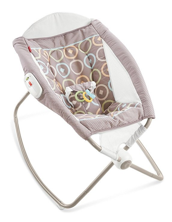
Above: Figure 4