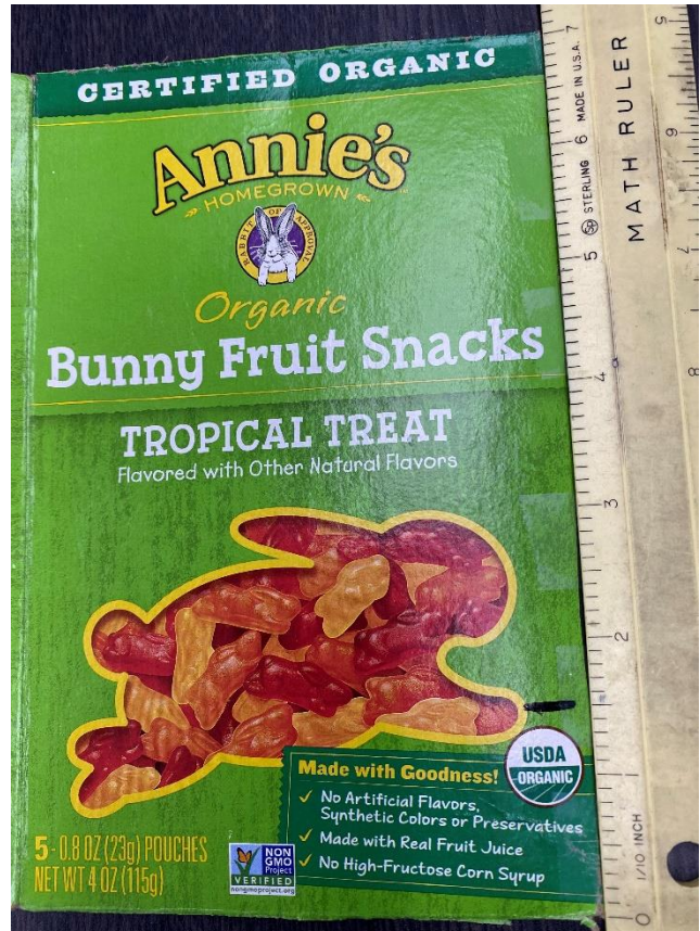
17. When separated, the Product's content appear as shown in the image below.