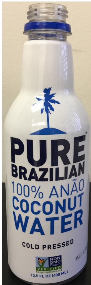
Principal Display Panel