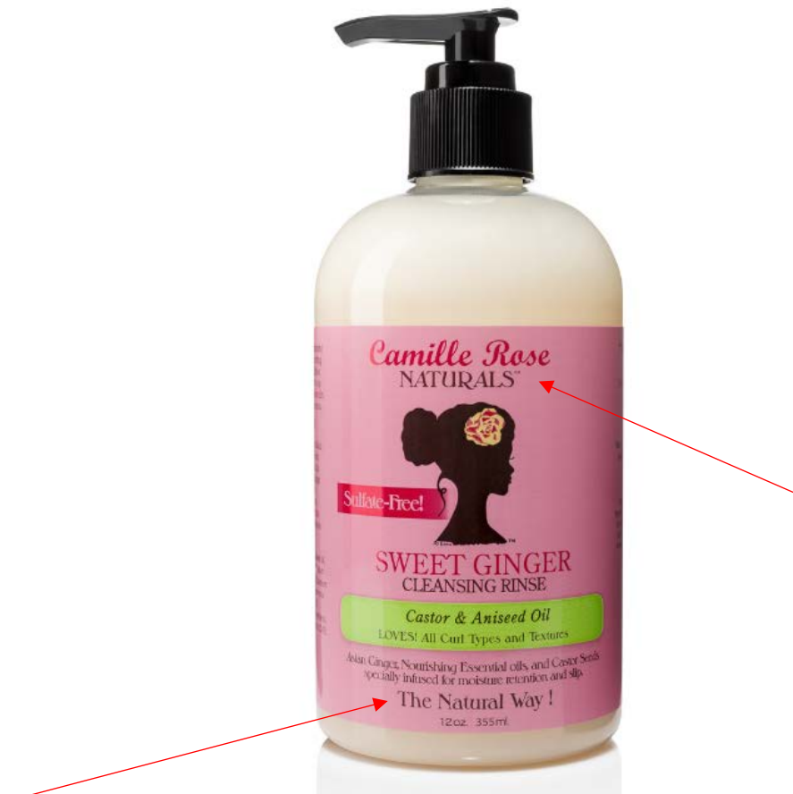
Camille Rose Naturals Sweet Ginger Cleansing Rinse

6. Despite the Products containing a number of synthetic ingredients, Defendant markets the Products as being “Natural.” The Products’ labeling is depicted below: