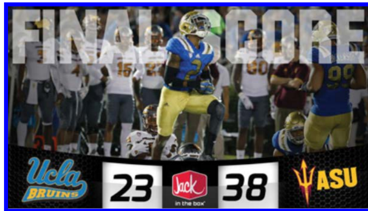
Sponsored post by official Twitter account of UCLA Athletics (@UCLAathletics)

180. Other Division I schools negotiate similar social media sponsorship arrangements and incorporate brand logos into their own athletic posts in exchange for payment from the brands.