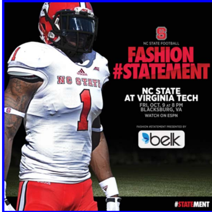
Sponsored post by official Twitter account of North Carolina State football (@PackFootball)

1 2 3 4 5 6 7 8 9 10 11 12 13 14 15 16 17 18 19 20 21 22 23 24 25 26 27 28