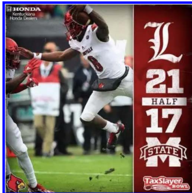
Sponsored post by official Instagram account of Mississippi State football (@hailstatefb)