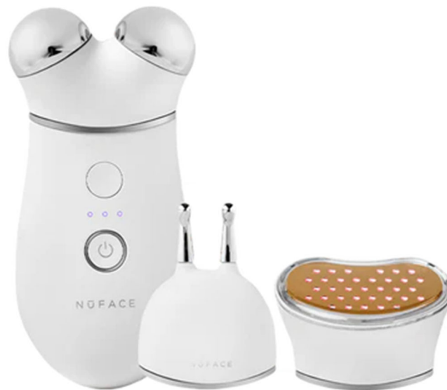
21 Figure 1: Trinity+ and Red-Light Attachment 26

8 31. Defendant manufactures, markets, and sells a number of facial toning 9 devices. The products at issue are the Trinity Classic and Trinity+ Facial Toning 10 Devices and their respective Red-Light Therapy Attachments.