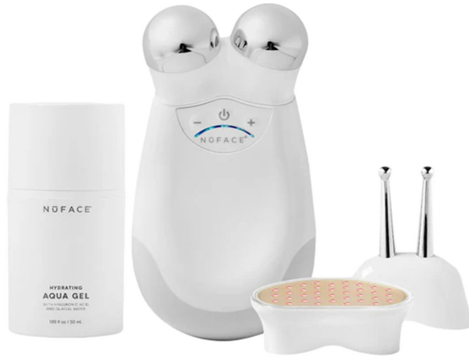
Figure 2: Trinity Classic and Red-Light Attachment 27

32. Defendant markets and sells the Devices in multiple distribution channels including, but not limited to, the NuFACE website, Amazon, Sephora, and Nordstrom.