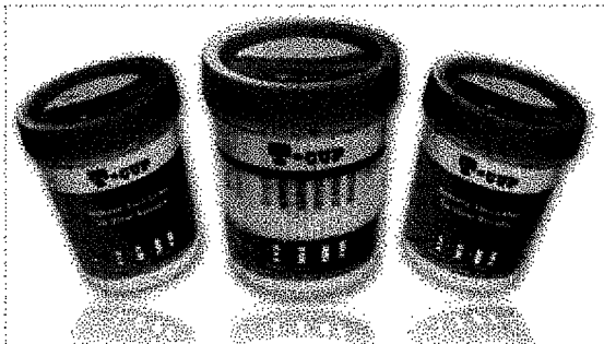
T-Cup (CLIA Waived)

Results at 5 Minutes Easy to Carry and Suitable for Point-of-Care Testing (POCT)