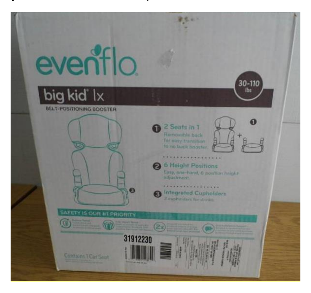
Packaging states "30-110 lbs."