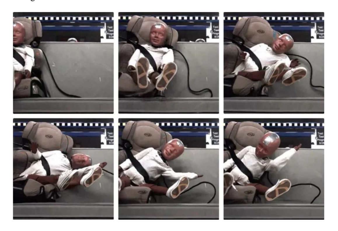
Video of Evenflo Side Impact Tests Show Child-Sized Dummies Thrown Violently Out of Shoulder Belts and Their Heads and Torsos Flying Outside the Seat

of the body — the shoulders and hips — the Evenflo test instead showed the belt slipped off the shoulder and wound up taut around the soft abdomen and ribs. In real life, that could cause internal organ damage. Id .