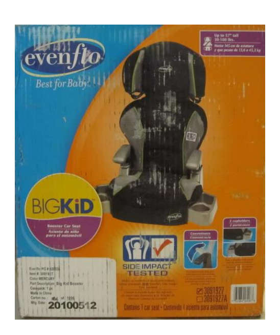
Evenflo's Booster Seat Packaging Features "Side Impact Tested" Claim