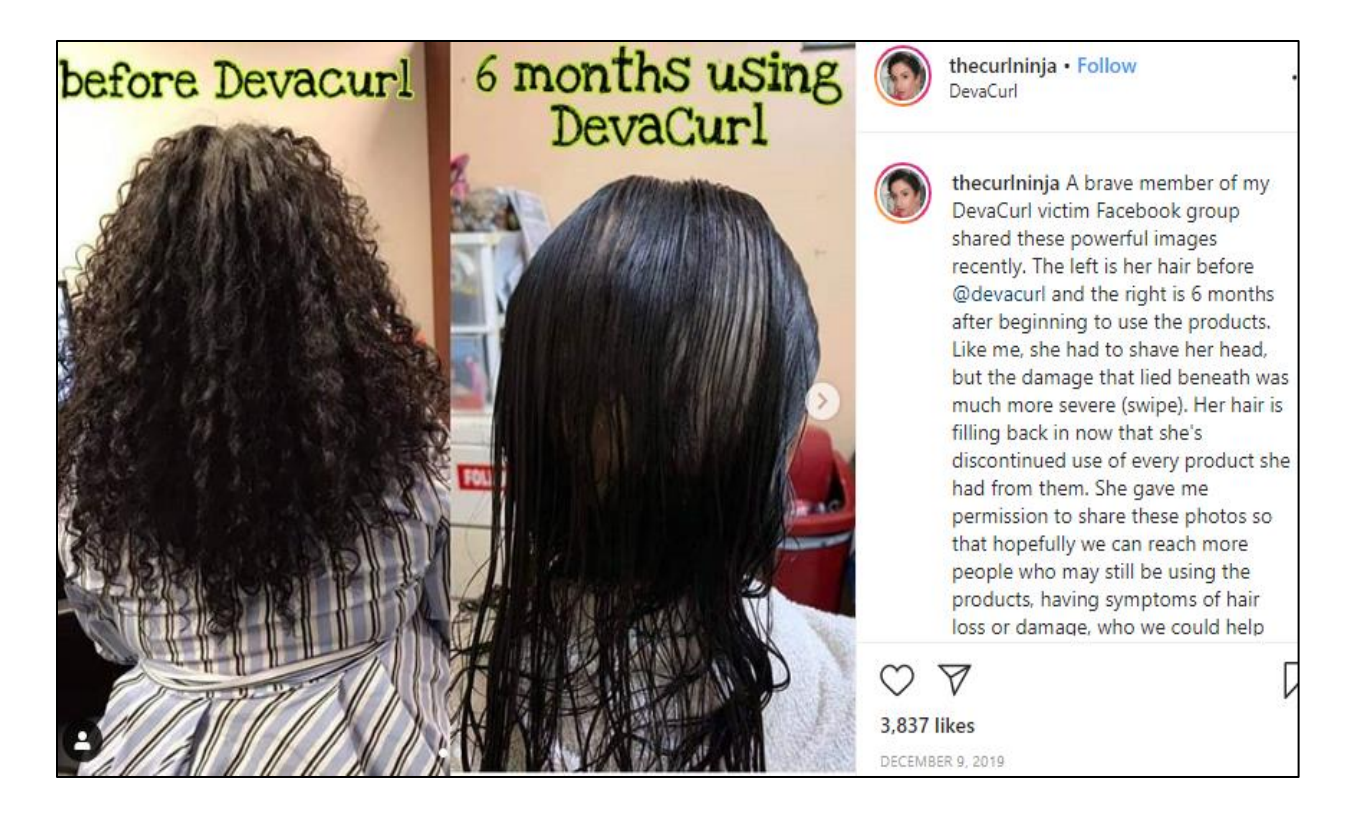
86. Additional online complaints-dating back several years, are documented below: